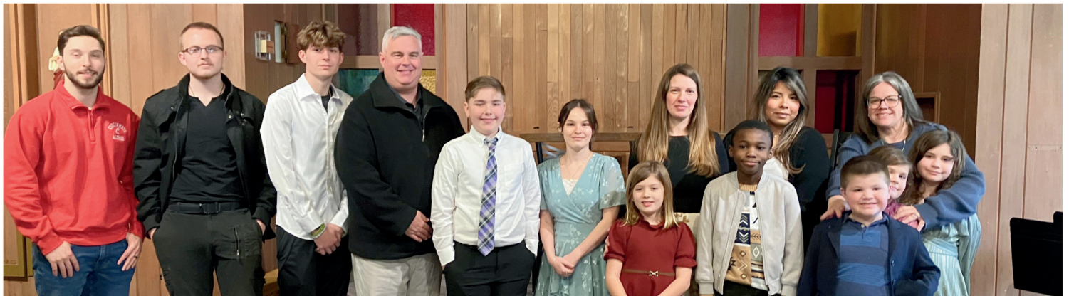
Catechumens from left to right (non-baptized)