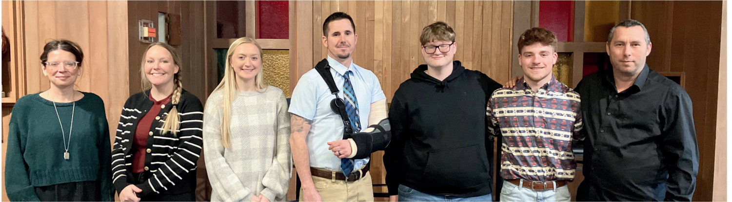
Candidates from left to right (baptized previously in another Christian faith)

Last Sunday, February 22, our Catechumens and Candidates who are preparing for entrance into the Catholic Church at the Easter Vigil, participated in the Rite of Sending at St. Bernadette, and the Rite of Election and Calling of Candidates to Continuing Conversion at the Cathedral. This marks the beginning of their intensive preparation during Lent before receiving the Sacraments of Initiation. We are blessed to have 29 adults and children coming into our Stella Maris Family at the Easter Vigil. Please pray for them during Lent, that they allow the Holy Spirit to continue to guide them in their journey to becoming Catholic.